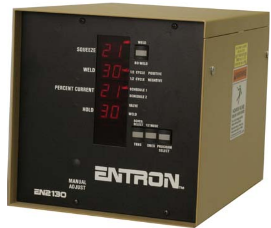
EN2130 Style "B" Cabinet 222mm x 222mm x 296mm 8-3/4" x 8-3/4" x 11-3/4"

Microprocessor-based Circuitry Spot Sequence Dual Weld/Dual Current LED Status Indicators All Functions Displayed Simultaneously Compact, Lightweight Air Cooled Cabinet Available with both 150 and 300A Air Cooled Contactors Error Code/Fault Outputs 87° First Half Cycle Delayed Firing, Anti-Saturation Circuit Dynamic Automatic Power Factor Equalization Dynamic Automatic Voltage Compensation, \pm 20\% of Nominal Line Emergency Stop Circuit Interlocking Pressure Switch Circuit Single Valve output standard (without transformer) Manual Current Adjust (optional)